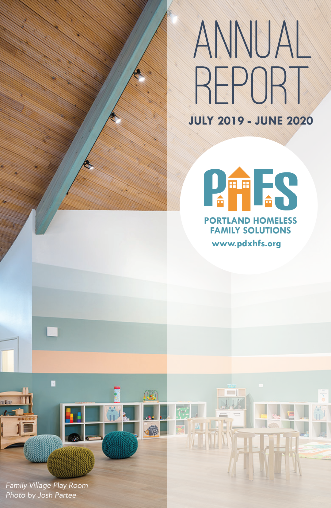
Family Village Play Room